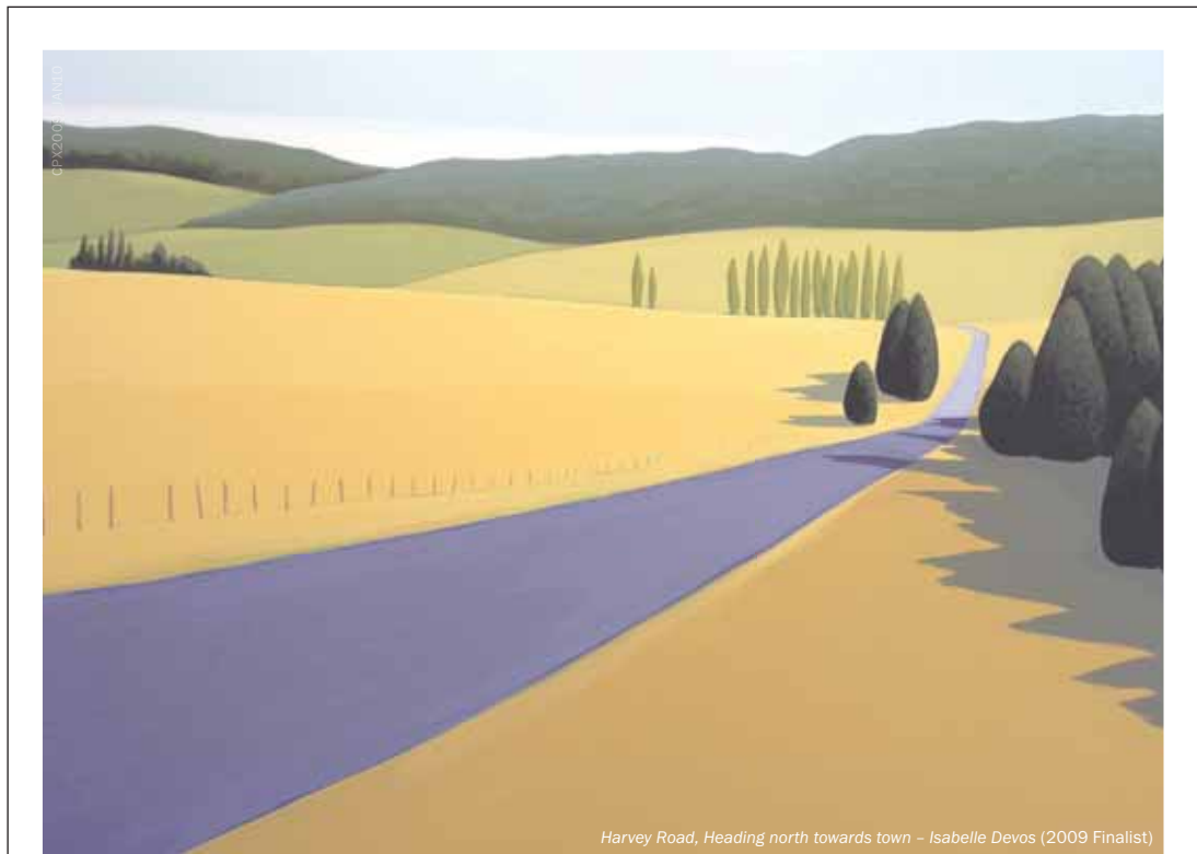
Harvey Road, Heading north towards town - Isabelle Devos (2009 Finalist)